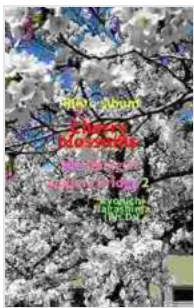
Photo album Cherry blossoms blooming at Dojima Bridge 2

In this comprehensive guide, we will provide you with all the essential tips and techniques you need to create stunning images of cherry blossoms blooming at Dojima Bridge. Whether you are a seasoned photographer or just starting out, this guide will help you capture the beauty of these fleeting blooms and create lasting memories.