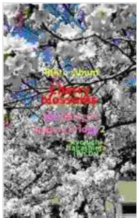
Photo album Cherry blossoms blooming at Dojima Bridge 2