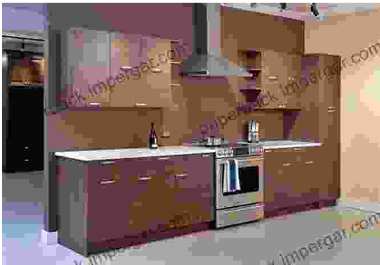
Contemporary Kitchen Cabinetry with Flat-Panel Doors and Concealed Hinges

on functionality. Flat-panel doors, concealed hinges, and integrated appliances create a streamlined and uncluttered aesthetic. Choose high-gloss finishes in neutral tones like white, gray, or black to accentuate the contemporary vibe. Handleless designs and touch-to-open mechanisms add to the sleek and sophisticated appeal.