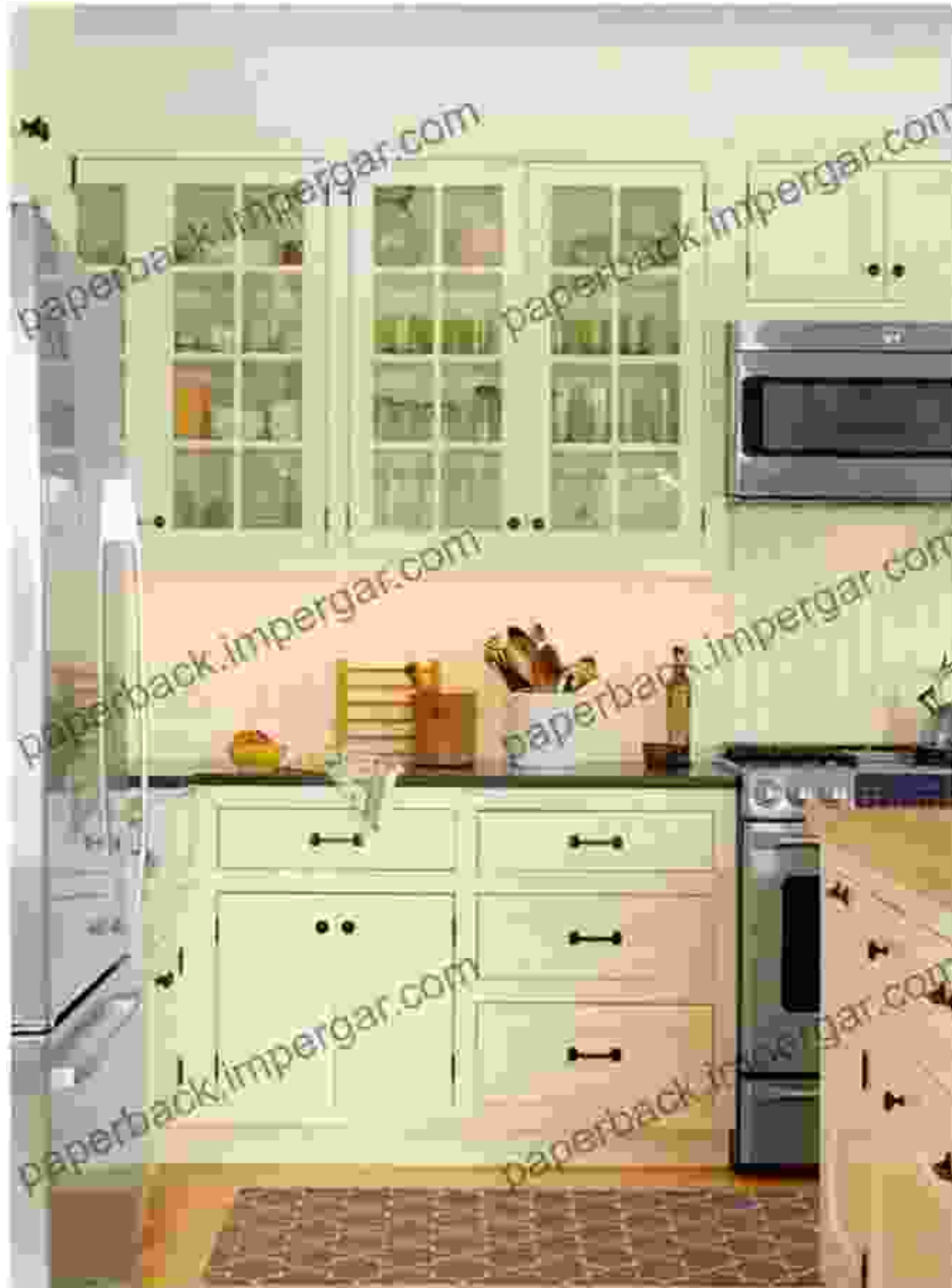
Modern Farmhouse Kitchen Cabinetry with Shaker-Style Doors and Beadboard Panels

clean lines, simple profiles, and a focus on functionality. Beadboard panels, shiplap accents, and shaker-style doors add a touch of farmhouse flair while maintaining a modern aesthetic. Choose warm wood tones and matte finishes to create a cozy and inviting atmosphere.