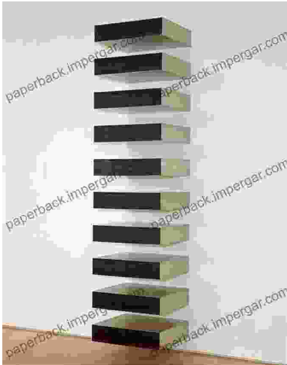
Donald Judd, Untitled (Small Box), 1973

Judd's furniture is also characterized by its simple, geometric forms. He often used wood and metal in his furniture designs. Judd's furniture is functional, but it is also sculptural. He believed that furniture should be beautiful to look at, as well as comfortable to use.