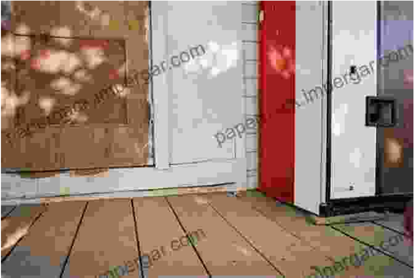
William Eggleston, Untitled (Greenwood, Mississippi) , 1989

Eggleston's use of color is both bold and nuanced. He employs saturated hues and unconventional compositions to create images that are both visually stunning and emotionally evocative. His exploration of color has had a profound impact on contemporary photography, challenging our assumptions about the role of color and its ability to convey meaning.