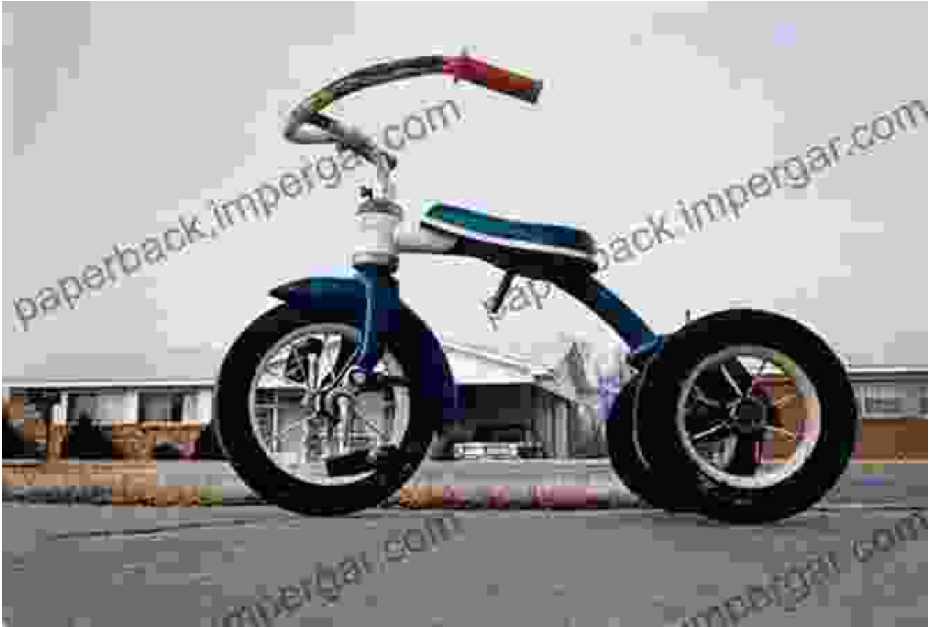
William Eggleston, Untitled (Tricycle) , 1973

Eggleston's work defies easy categorization, bridging the gap between documentary realism and postmodernism. His images document the world around him with a keen eye for detail, yet they also reveal the constructed nature of photography and the subjective experiences of the artist. This complex interplay challenges our assumptions about photography's ability to objectively capture reality.